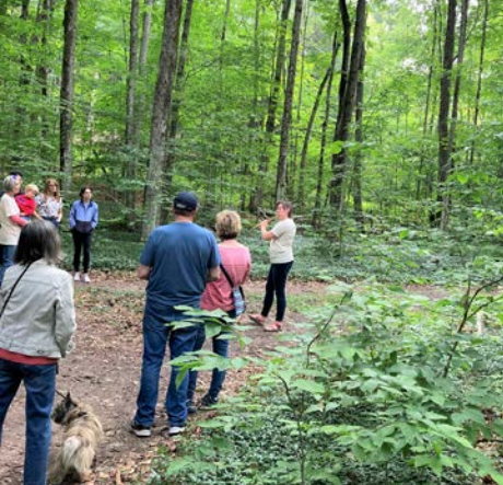
Beautiful flute song