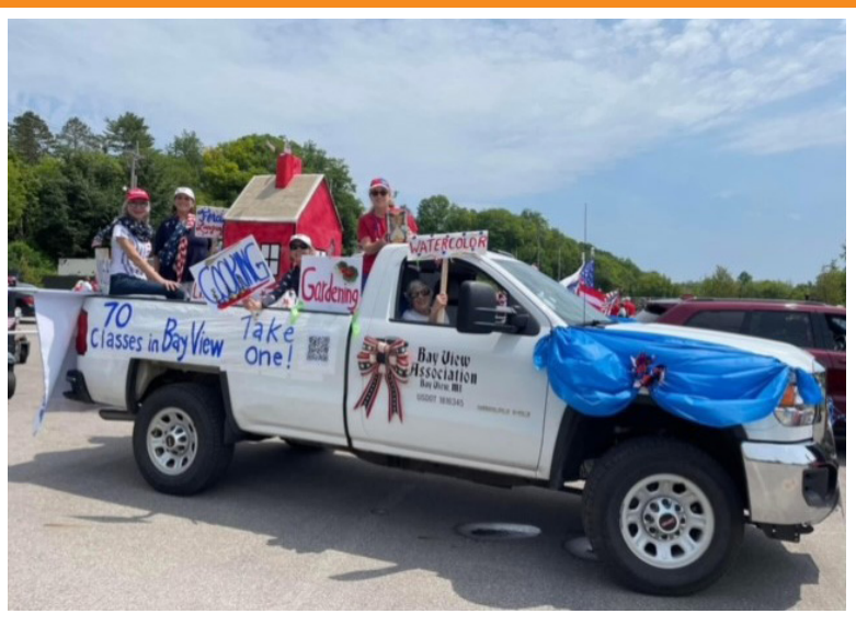
Education Program-4th of July Parade entry, Harbor Springs

The presentation, to be held in Evelyn Hall, will address the very timely and important topic of cottage rebuilding and infill construction in Bay View. The talk will include power point and a question and answer period.