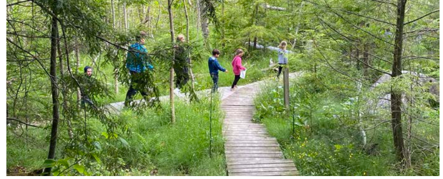
Woods Advisory