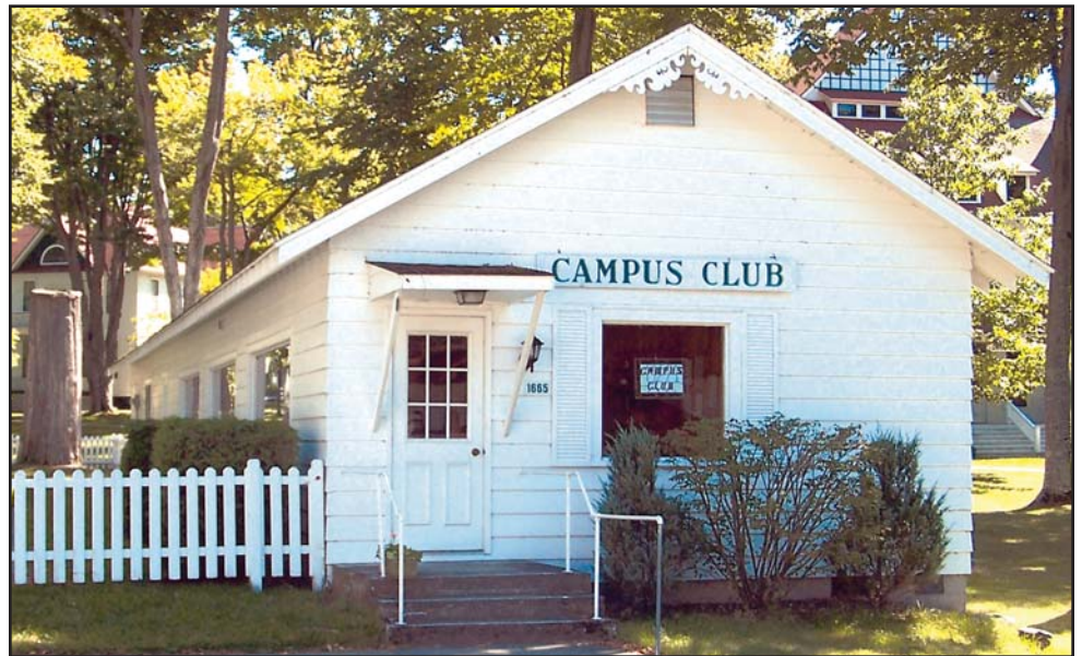
Once again the Campus Club will be the setting for a host of speakers on various topics.

Petoskey News-Review, will bring the focus back to local affairs when he discusses the "State of Petoskey" at 7:30 p.m. Tuesday, July 15, also at the Campus Club.