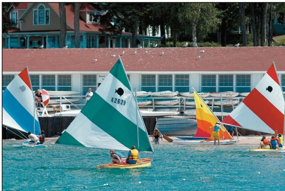
Sailors dart across Little Traverse Bay at the Bay View Waterfront during a 2006 Sunfish Sailing race.