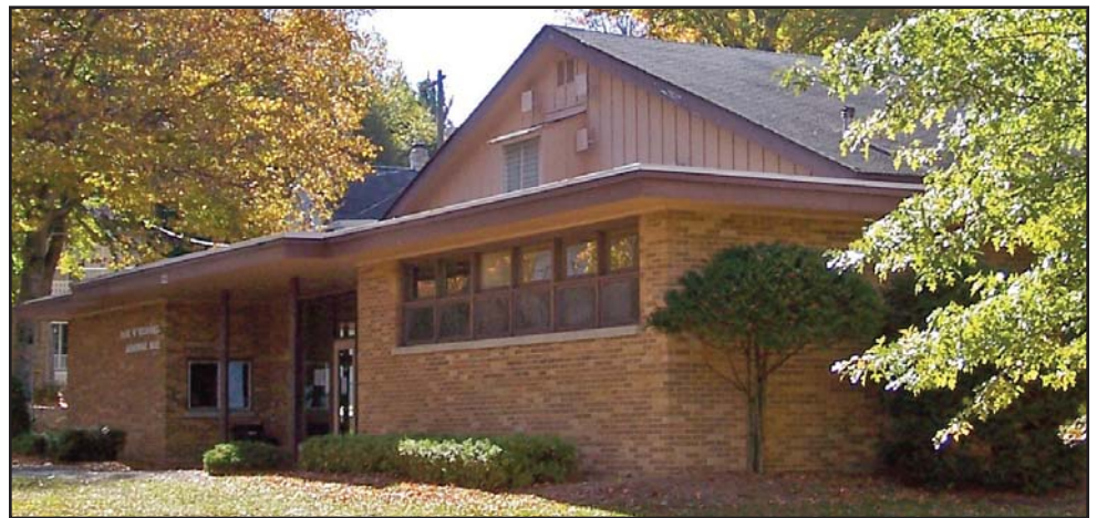
Voorhies Hall is undergoing extensive renovation.

Grass/leaves/flower cuttings are picked up on Monday, Wednesday and Friday. Brush is picked up Monday and Friday. Materials need to be out by 1:30 p.m. Recycling began Thursday. Be sure to have your tote out by 8 a.m.