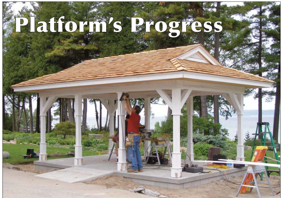
Workers from Walworth Construction put some of the finishing touches on a reconstruction of the Reed Street Station train platform by the Memorial Garden. See story on page 4.