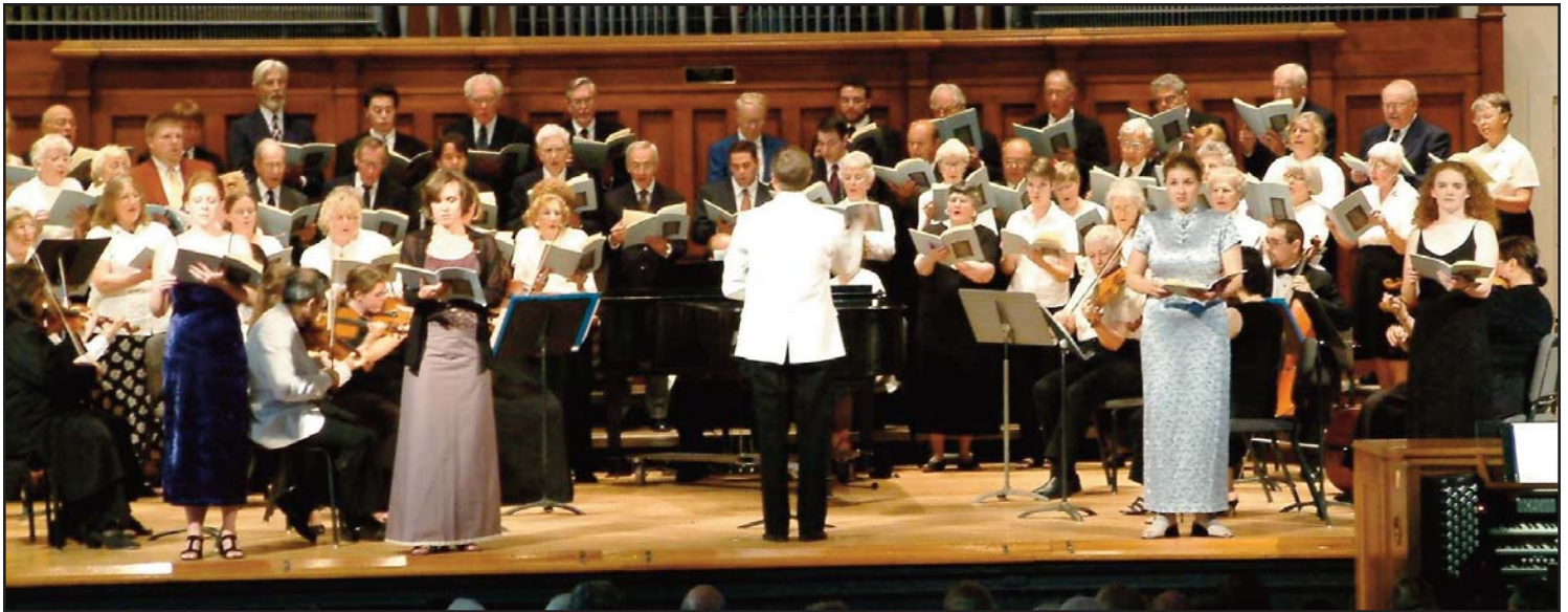
The Bay View Festival Chorus performs during a John M. Hall Vespers Concert.